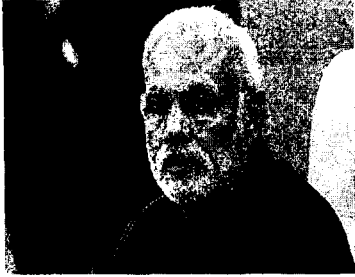
Prime Minister of India- Mr Narendra Modi