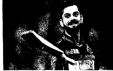
Indian Cricket Team Captain- Mr Virat Kohli