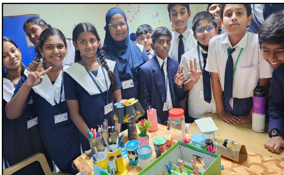
'Recycling Takes Little Effort on Your Part, But Makes a Big Difference To The World.'

CCA conducted as Recycling competition to enhance the inborn talents and creativity of the students.