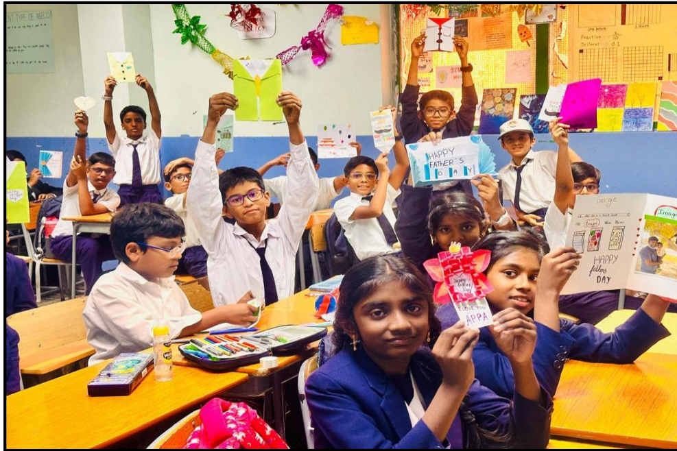
Father's Day Card Making Activity conducted during CCA period to enhance the creativity and love towards Father.

From April to July, students actively participated in a variety of engaging CCA activities. These included Self-Introduction to boost the confidence, the creative Corkboard Activity , a Labour Day Speech Competition to honour workers, heartfelt Mother's Day card making , awareness sessions on Anti-Tobacco Day , a fun-filled Cartoon Drawing Competition , and an informative World Environment Day Chart-Making Activity . These events nurtured expression, awareness, and creativity among the students.