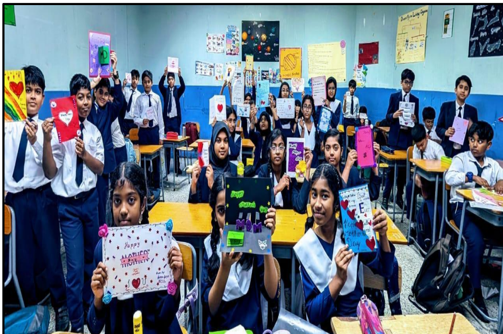
Mother's Day Card Making: 'A Mother's Love is the Purest form of Magic.'