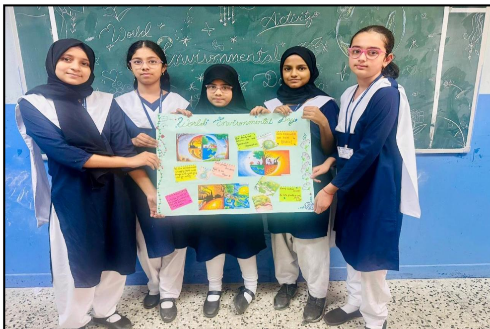
World Environment Day Chart-Making Activity: 'Let's nurture the nature so that we can have a better future.'