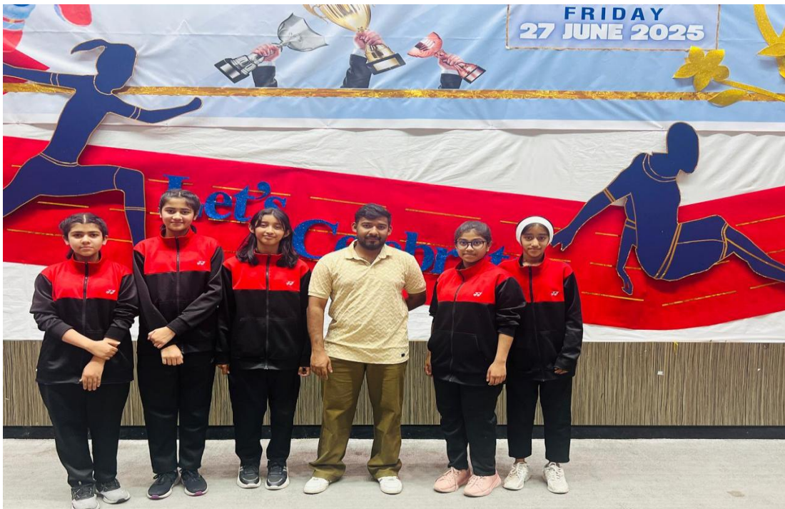
BMS (Cluster Girls Team 2025)

The 33rd cluster meet was held in Jeddah from 23rd June 2025 to 27 June 2025. BMS' proud participants at the cluster for Athletics made IISD proud with their scintillating performances.