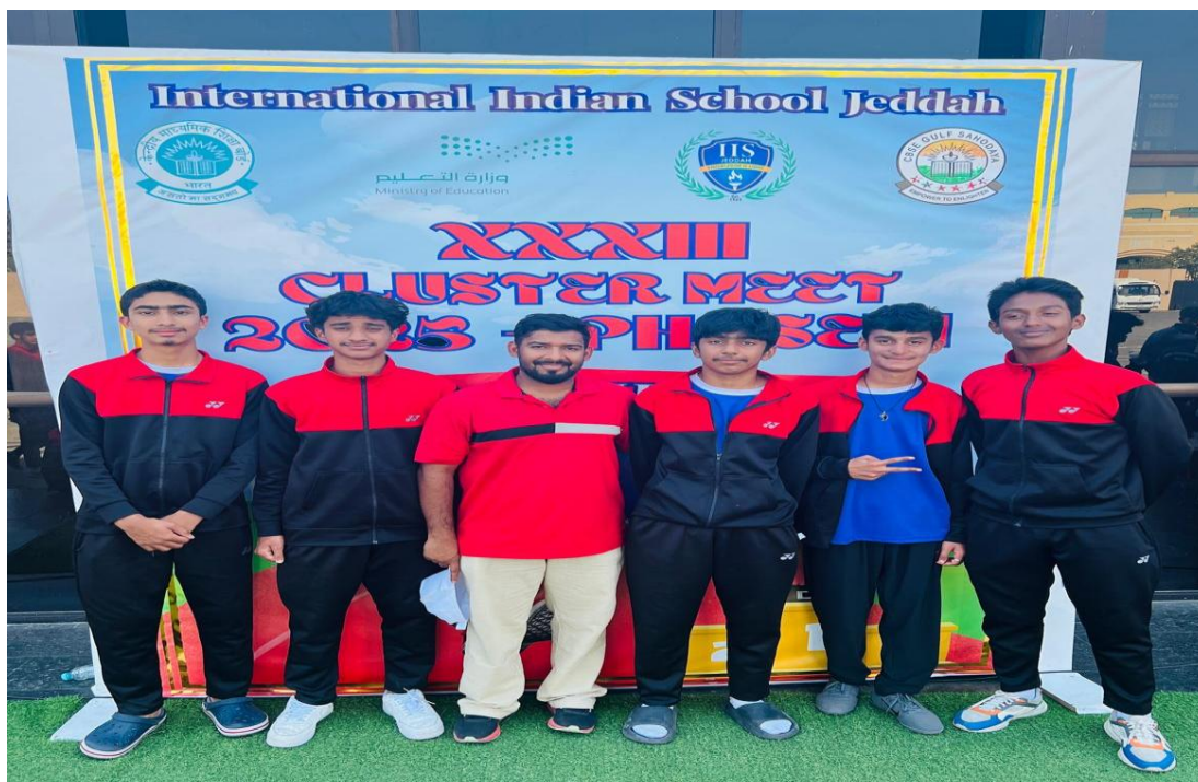
BMS (Cluster Athletic Team 2025)