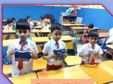
Folding of T-shirt