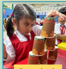
Count and stack