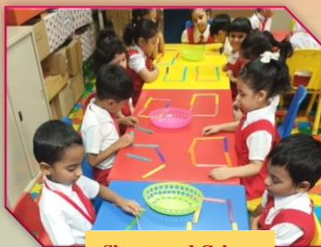
Shapes and Colors