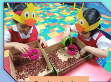
Pouring of pulses