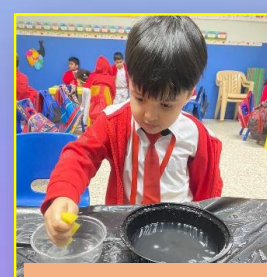
Sponge water transfer