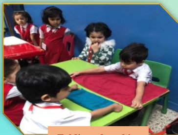
Folding of napkin