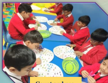
Count and peg